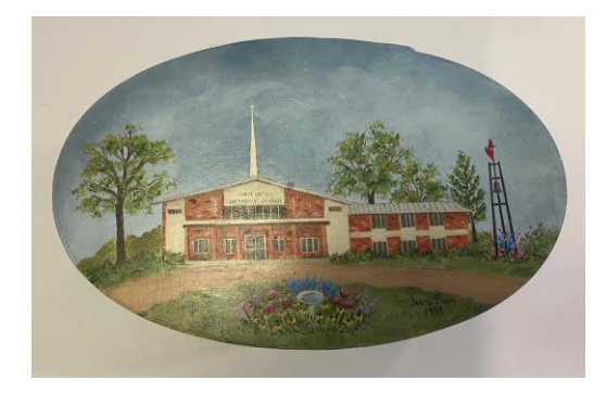
Top of box

In the Spring of 1997, eight Muncy First United Methodist Church members gathered together to study various styles of decorative painting under the leadership and direction of Jeane Smay. In 1999, the members chose a project to use oval shaped boxes which included lids for their own individual design and paint colors. The project was completed the same year.