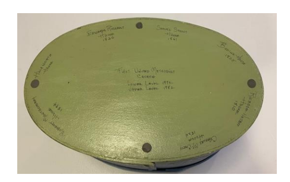
Bottom of box has names and build dates of properties depicted.