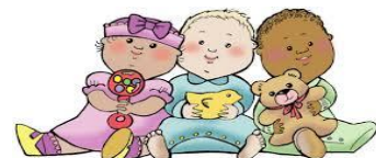
Births in the Church Family

To add your birthday or anniversary, please contact the church office (570-546-8030, office@firststumcmuncy.org )