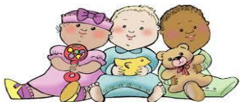
Births in the Church Family