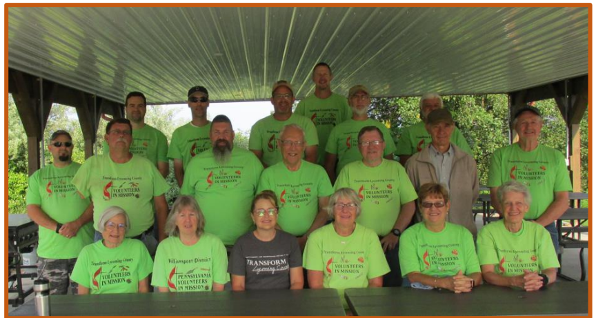
Pictured: some of the 21 volunteers from last year, 2023